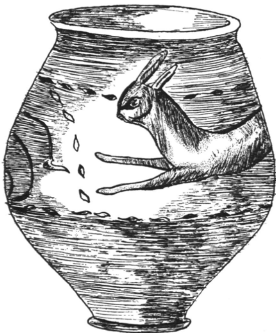
A ROMAN POT FROM OTFORD.