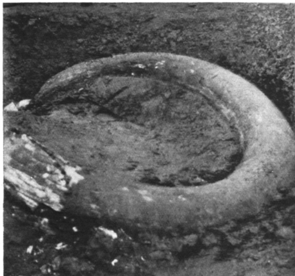
MAMMOTH TUSK DISCOVERED AT SITTINGBOURNE.